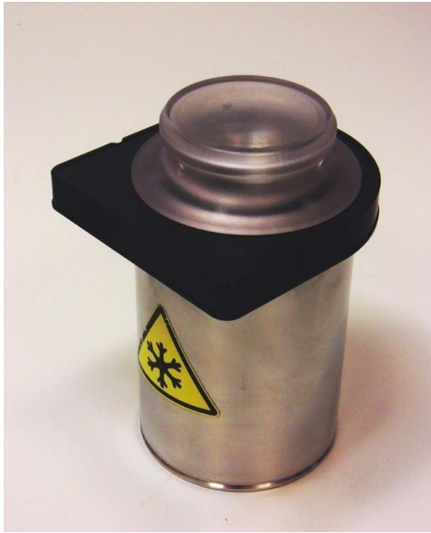
Autoloader docking interface